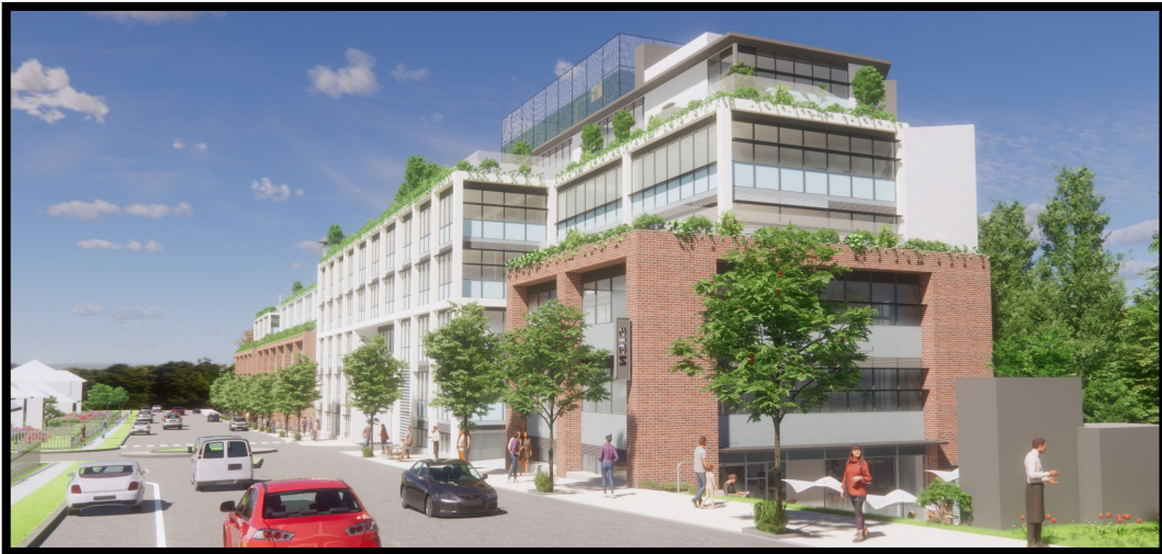
Figure 5: Bachell Avenue from the West.