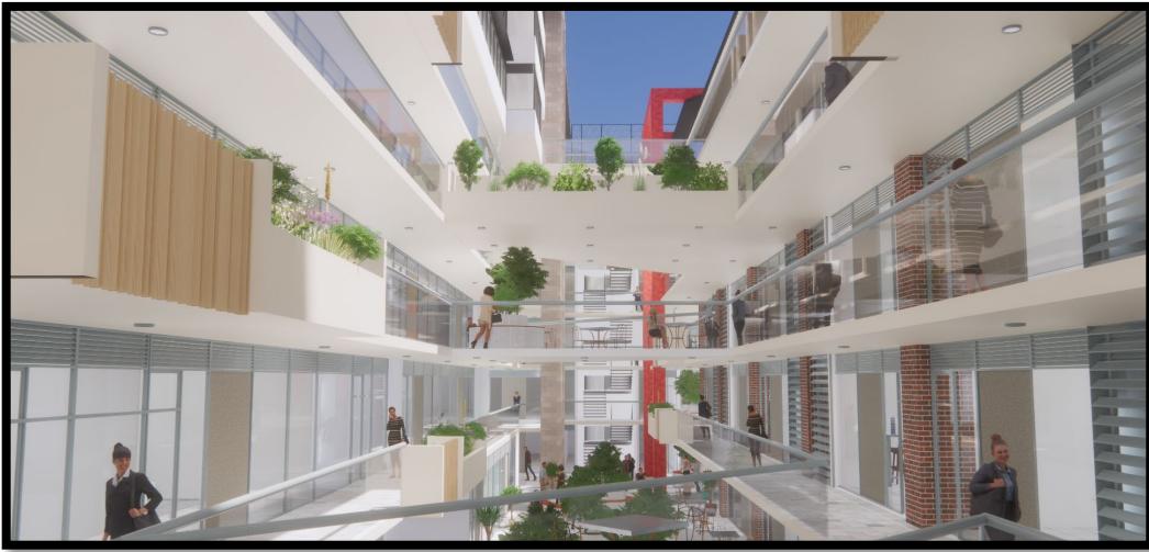
Figure 9: View of internal open void.