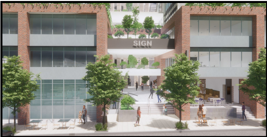
Figure 4: view of the Main pedestrian entry.