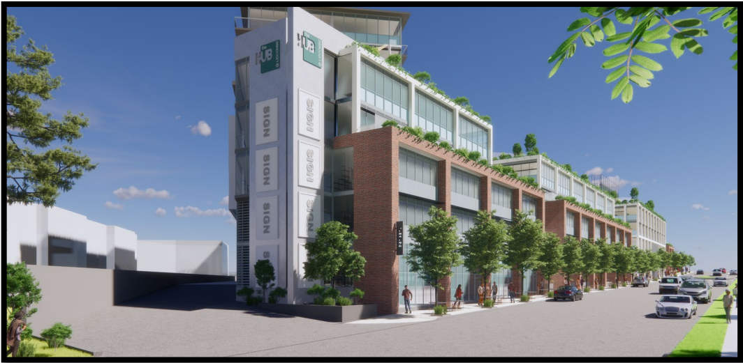
Figure 3: Bachell Avenue from the North.