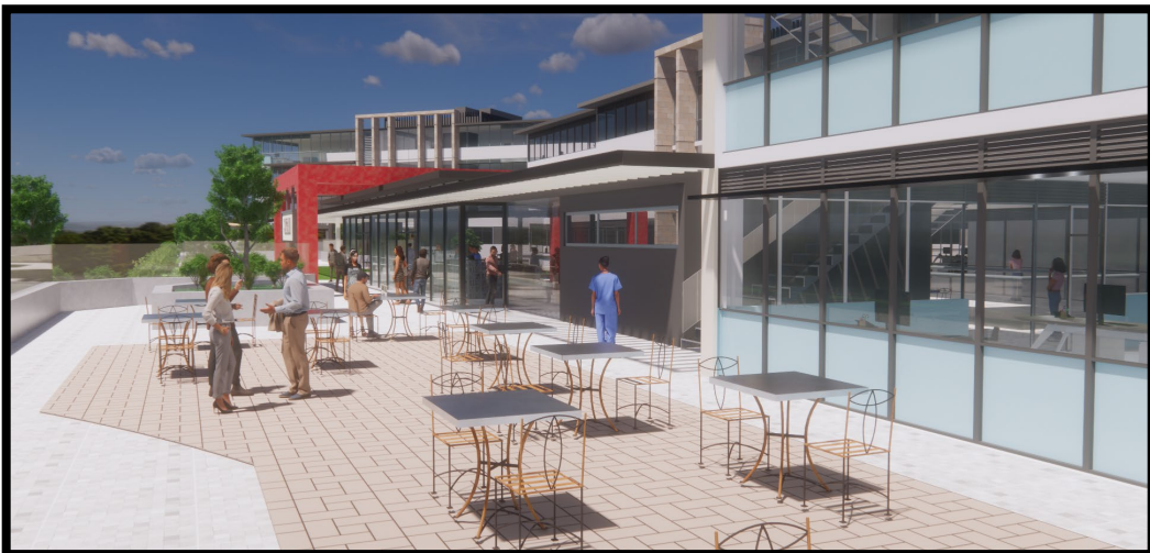
Figure 8: level 5 terrace and Café.