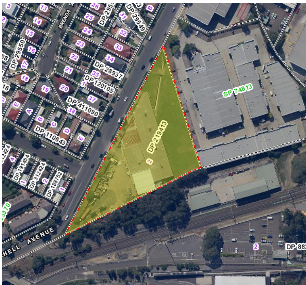
Figure 2: Aerial of site prior to redevelopment