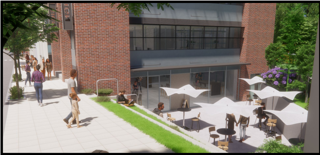
7: View of South sunken courtyard.