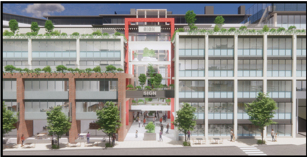
Figure 6: View of the entry with vertical connection to terrace café.